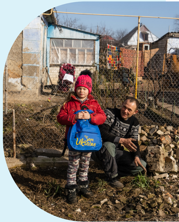
Child supported by Save Ukraine

Our powerhouse Co-Founder, Deborra-lee Furness received the Order of Australia for distinguished service to children.