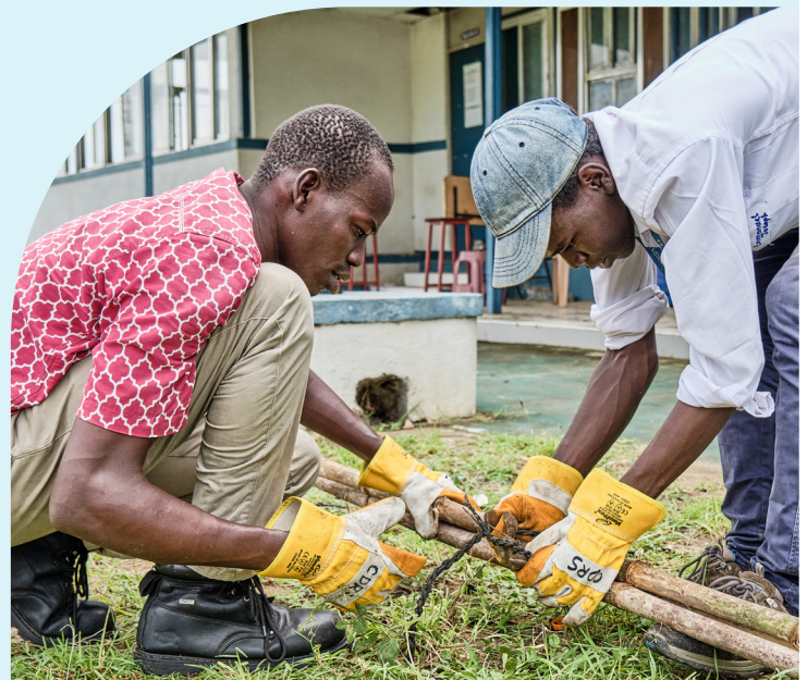
Medair team in South Sudan building a shelter

We are thrilled to see a second cohort of students go through the TechLink program in partnership with Google and Administration of Children Services